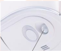
Intelligent eye sensor

Daikin single and multi-zone systems offer SEER options up to 26.1 and state-of-the-art technology to help with efficiency. In addition to low operational sound levels, Daikin inverter technology also allows the system to deliver the capacity required to maintain the desired room temperatures. This function typically reduces energy consumption by up to 30% or more (compared to traditional fixed-speed ducted systems).